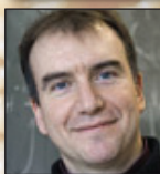
Condensed Matter Seminar, Pierce 209

"Single-cell transcriptomics: Unbiased single cell approaches for gaining insight into immune cell behaviors"